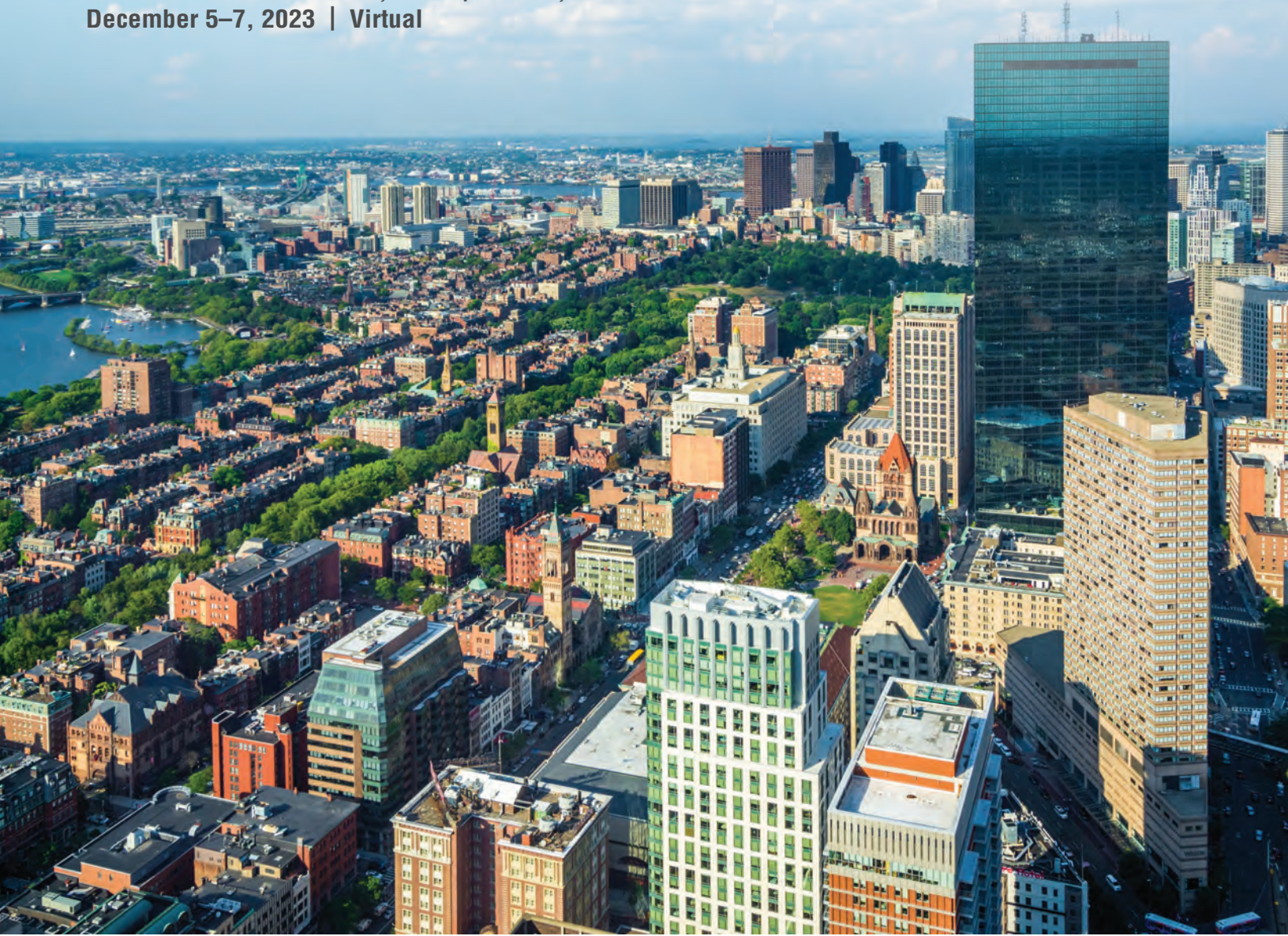
Exhibit & Sponsorship Prospectus

November 26–December 1, 2023 | Boston, Massachusetts December 5–7, 2023 | Virtual