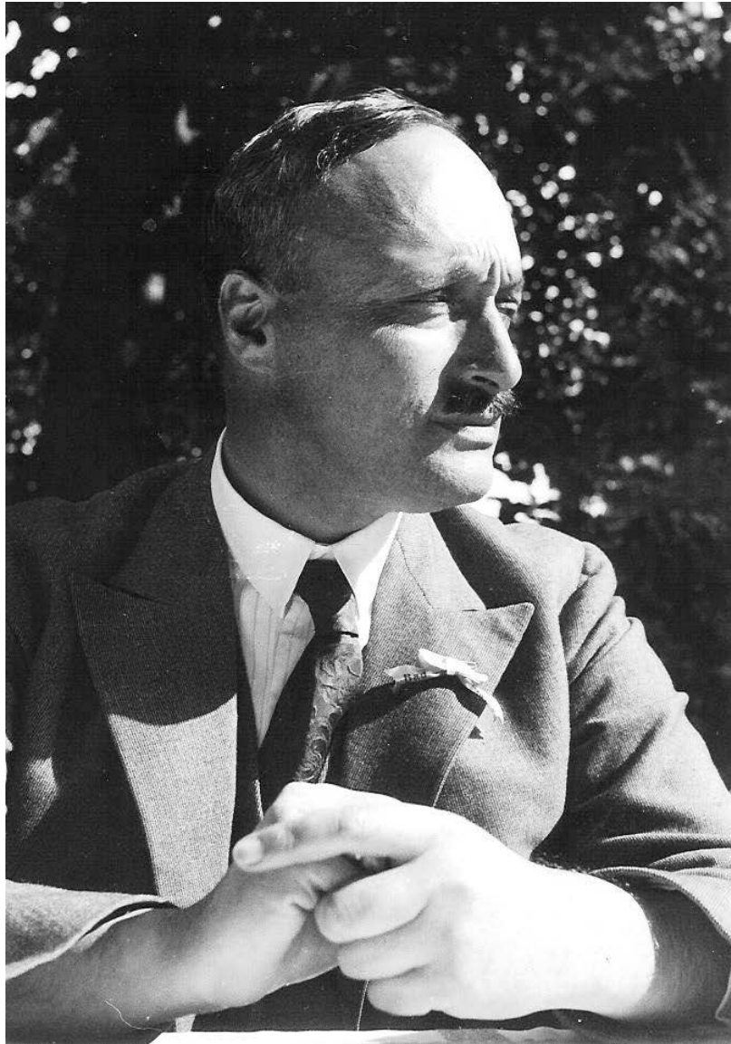
49. James (“Opa”) Franck in Göttingen